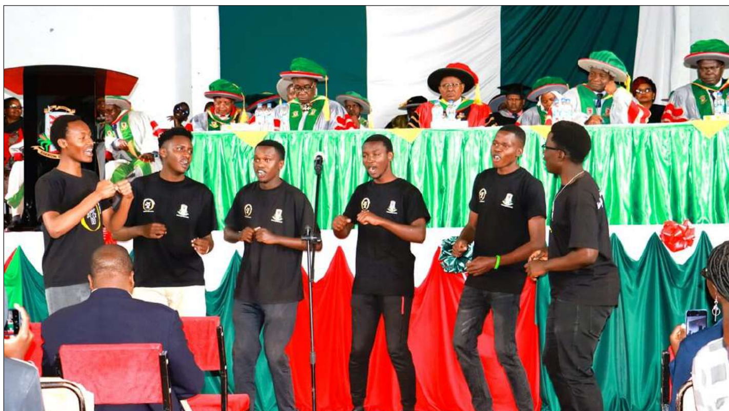
Egerton University students entertain the audience during the Vice-Chancellor's Address to First-Year Students. The event took place on 23 August 2024 in Kilimo Hall, Main Campus, Njoro.