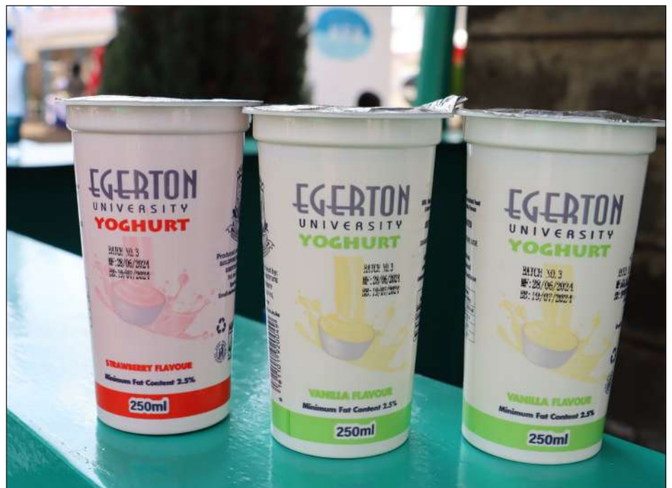
Egerton University Yoghurt, produced by the Department of Dairy, Food Science and Technology, returns to the market with refreshed flavours and new packaging. The Guilford Dairy Plant also serves as a practical training centre for Food Science students.

In conclusion, Egerton University's journey with DIGU is one of promise and potential. As we nurture growth and sustainability in these ventures, we reaffirm our commitment to providing quality services, expanding our reach, and securing a financially robust future