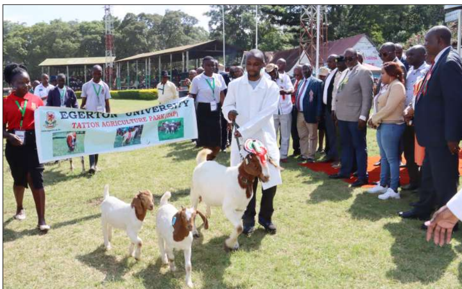
Egerton University showcases the Boer goat and its kids at the Nakuru ASK Show opening ceremony on 5 July 2024. The University emerged as a winner in several categories at this year's event.