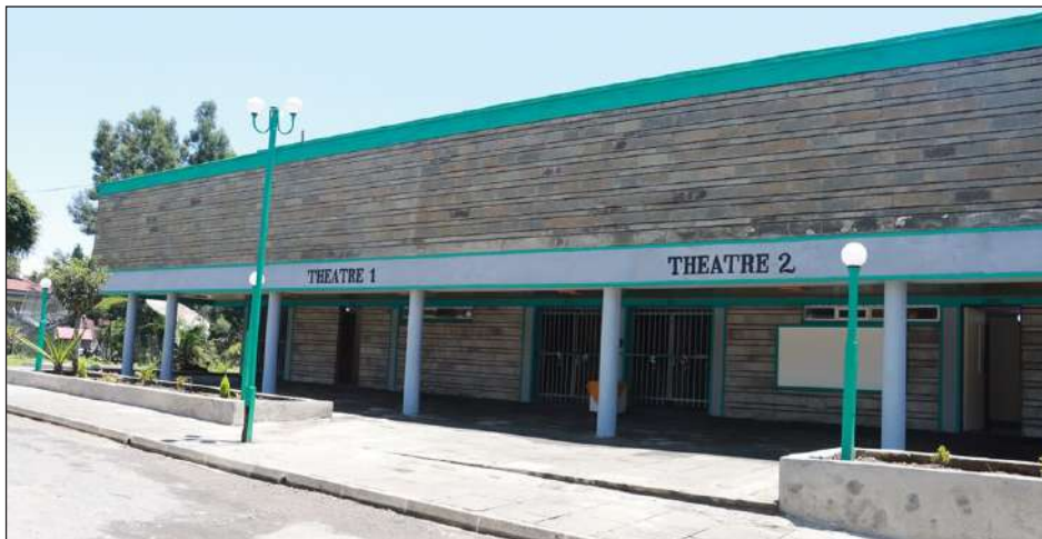
Front View of the Renovated T1 and T2 Lecture Theatres

The air conditioning units in the lecture theatres were repaired, tested, and recommissioned to ensure optimal performance. The ceilings received modern finishes that enhanced the aesthetic appeal and acoustics of the rooms, while the washrooms were fully