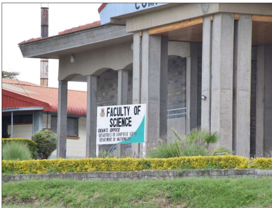
The main entrance of the Physical Science Complex at Egerton University's Main Campus in Njoro.