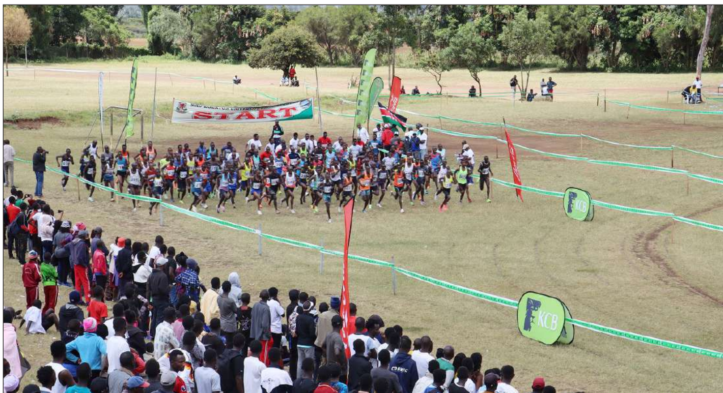
Participants take off at the starting line of the 9th edition of the Mau-Egerton University Cross Country, held on 2 March 2024 at the Sports Ground, Main Campus, Njoro.

striving to elevate its global standing further.