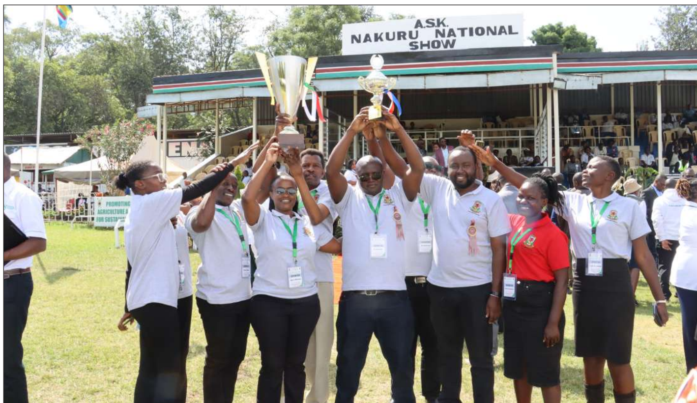
The Egerton University team celebrates with trophies at the Nakuru ASK Show, held from 3–7 July 2024 in Nakuru City.

The author is the Communications Officer at the Directorate of Marketing and Resource Mobilization. The original version of this article was published in the July 2024 issue of Egerton University's Digital Newslink.