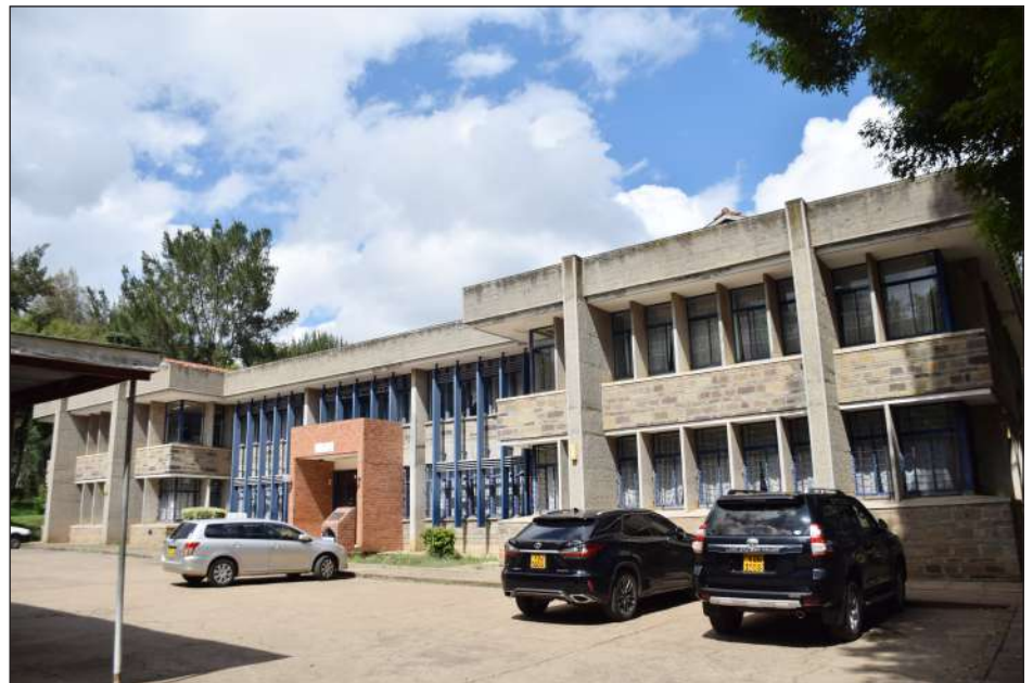
The front view of the Faculty of Arts and Social Sciences building at the Main Campus, Njoro, seen from the parking lot