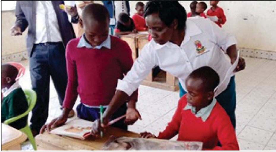
The University Library Community Outreach Team at the Ananda Marga Academy in Njoro