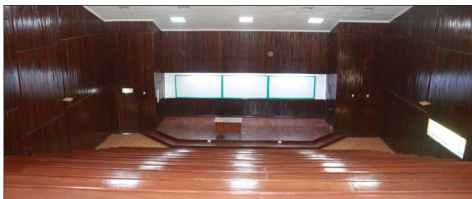
A newly refurbished lecture theatre at Egerton University, featuring upgraded timber seating, modern PVC floor tiles, and a restored public address system. The theatre, provides students with a comfortable, functional learning environment.

As Egerton University continues to invest in its infrastructure, the renovation of these lecture theatres is a testament to its dedication to academic excellence and student welfare. These improvements are part of a broader plan to upgrade the University's facilities and maintain its standing as one of Kenya's premier institutions of higher learning.