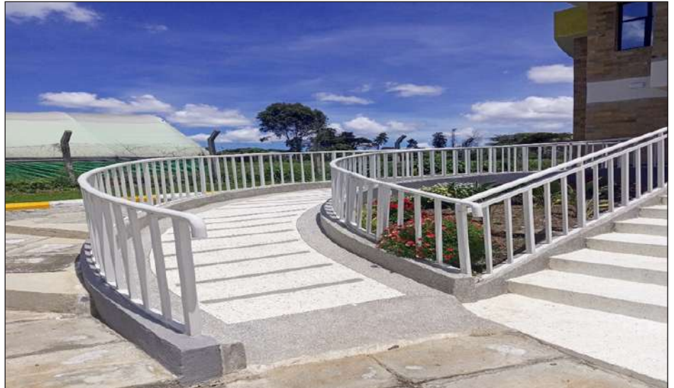
A new ramp provides easy access to the first floor of the TAGDev building, making it more inclusive for People With Disabilities. This addition aligns with the University's commitment to disability-compliant infrastructure.

In addition, in the course of the year, the Unit involved PWDs in extracurricular activities in various categories. For example, the office took part in the university-wide orientation for First Year students, during which it sought to induct and create awareness among members of the University Community on matters of Inclusivity. Secondly, the Unit organized various team-building activities (which were carried out at the Lord Egerton Castle); carried out an Accessibility Audit on three campuses, namely the Njoro Main Campus, the Nakuru City Campus